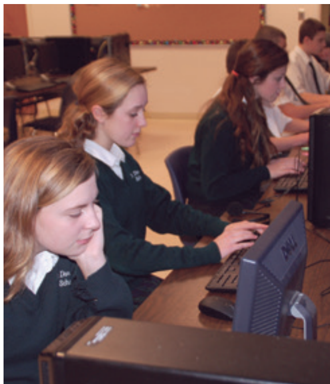
Students using the updated computer lab.

Thanks to the support of so many families and friends of St. Dorothy School we have been able to make significant improvements over the last year, and particularly over this past summer, to the school and campus. The computer lab in the church annex is updated with new computers and furniture. The second floor of the school building (Grades 1-4) is outfitted with new desks and chairs. New outdoor signage around the campus better directs students and visitors to the various offices, classrooms, and the gymnasium. The gymnasium lighting has been upgraded which benefits not only the sports teams but improves our physical education classes, our morning prayer and assembly, special events and programs, and parent meetings and presentations. With the help of the parish Heritage of Faith funds, the gym kitchen has been remodeled. Further facilities enhancements include improvements to rest rooms, water fountains, and faculty spaces. It is only through your support that we are able to make these enrichments to our students’ educational experience. Take a look around the next time you are on campus and see your help in action!