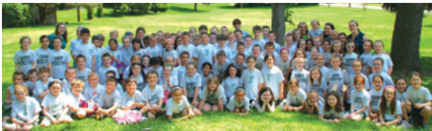
St. Dorothy's second grade partnered this school year with second and third grade students from St. Francis of Assisi School in Springfield as pen pals to give the students a fun way to communicate through traditional letter writing practice. The pen pals met in person at a picnic held at St. Dorothy School in May.