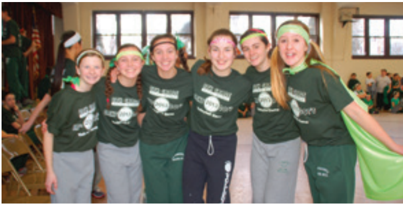
Some of the eighth grade ready to take on the teachers in the beach ball volleyball match.